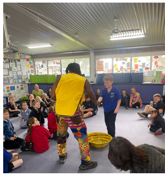
"Building Success and Friendship"