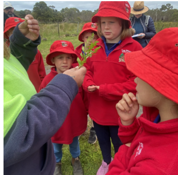
We were surprised that water parsley tasted like snowpeas! It grew where the ground was very damp. Our guide introduced us to different sorts of bush tucker.