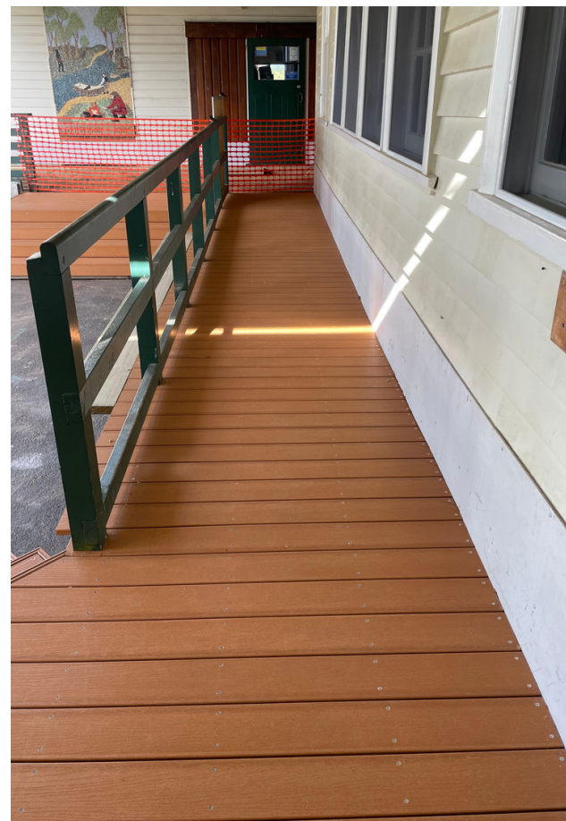
Above: Front access / walkway.