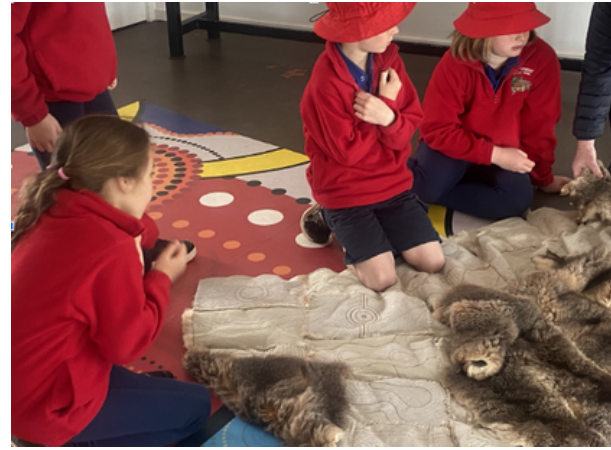
Learning how and why possum skin cloaks are important in Gunditjimarara culture.

Students are also continuing to learn the names of body parts and counting from one to ten in Gunditjimarara language.