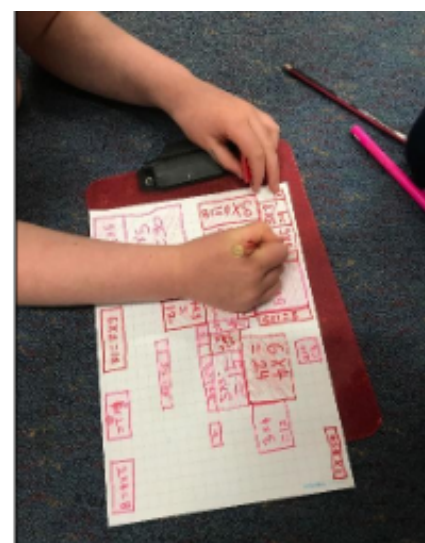
Spaces are filling up – some arrays made need to be split.