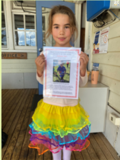
Presented: 8 April 2022